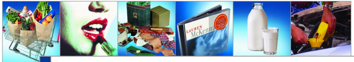
Auto Splice Dual Unwinder With Festoon